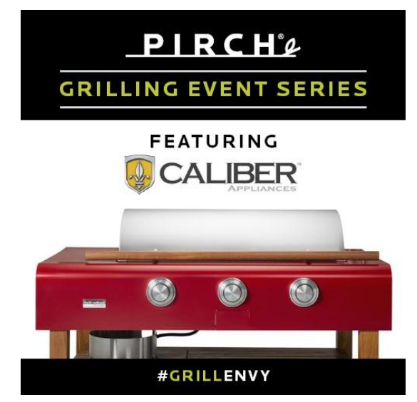
FOR IMMEDIATE RELEASE

Caliber Appliances • 17812 Metzler Lane • Huntington Beach, CA 92647 • 714.848.1349 • Caliberappliances.com